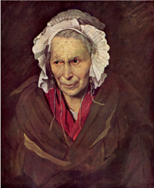
Portrait of a Woman Suffering from Obsessive Envy, also known as The Hyena of the Salpêtrière