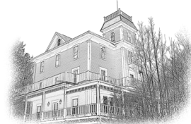
Old Mansion House

“ Gamache enjoyed going to churches for their music and the beauty of the language and the stillness. But he felt closer to God in his Volvo. ”