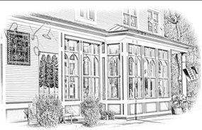
Brome Lake Books

“ No, I’m fine. And yes, I mean that sort of FINE, said Reine-Marie, making reference to the title of one of Ruth’s poetry books, where FINE stood for Fucked up, Insecure, Neurotic, and Egotistical. ”