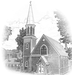
St. George’s Church

“ Sometimes, a weary traveler crested the hill and looking down saw, like Shangri-La, the welcoming circle of old homes. Some were weathered fieldstone built by settlers clearing the land of deeply rooted trees and back-breaking stones. Others were red brick and built by United Empire Loyalists desperate for sanctuary. And some had the swooping metal roofs of the Québécois home with their intimate gables and broad verandas. ”