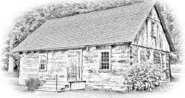
Brome County Historical Society

“ One must always have a song in the heart. And an éclair in the hand. ”