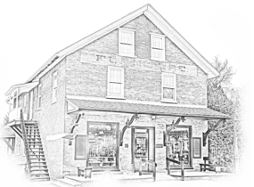
La Rumeur Affamée

“ No, I’m fine. And yes, I mean that sort of FINE, said Reine-Marie, making reference to the title of one of Ruth’s poetry books, where FINE stood for Fucked up, Insecure, Neurotic, and Egotistical. ”